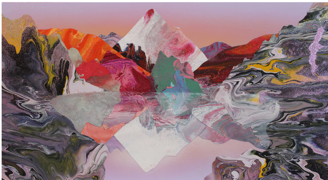
Kate Shaw, La-la Land 2013, Acrylic and resin on board, 30 x 70cm, Image courtesy of the artist and Fehily Contemporary, Melbourne

Horsham Regional Art Gallery 31 July - 27 September 2015