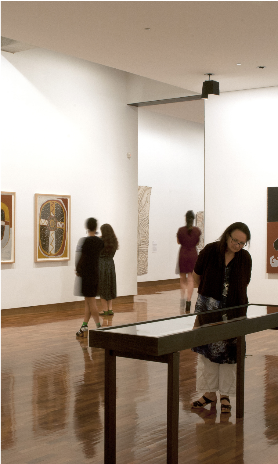
The world is not a foreign land at The Ian Potter Museum of Art, photo courtesy of Viki Petherbridge.