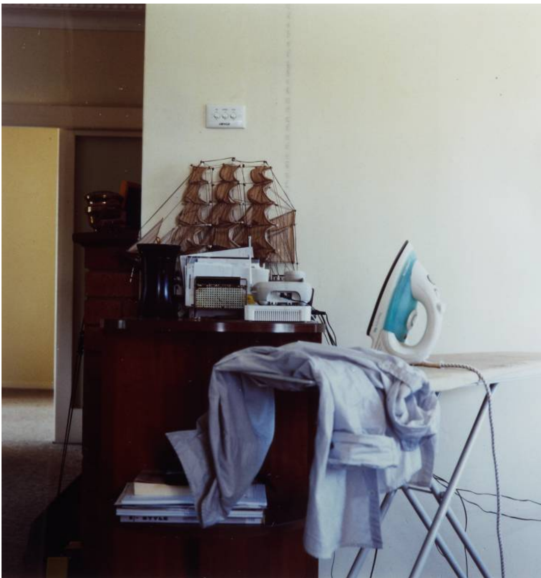
Simryn GILL from Inland 2009 cibachrome and gelatine photographs Courtesy the artist and Breenspace, Sydney

Inland (2009) is a new series, which was commissioned for this exhibition. Using the same process to produce Dalam , Gill photographed this series on a road trip; however this time in Australia, from northern New South Wales to South Australia and across the bight to Western Australia. The photographs include views of the horizon, skylscapes, interior still life compositions and close ups of stones collected by Gill during her travels. Inland is at the heart of the exhibition and the mode of presentation differs to all other series in the exhibition, as these precious handmade small scale colour and black and white images are assembled on a table in piles for the visitor to examine, with white gloves.