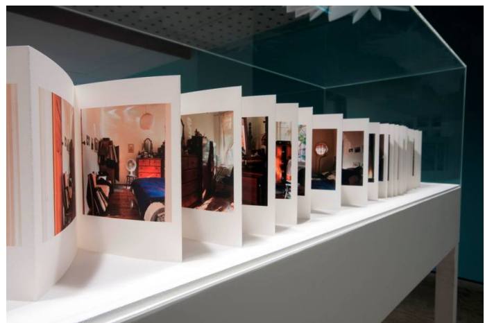
TOP: Simryn GILL from Dalam 2001 260 type C photographs, Courtesy the artist and Greenspace, Sydney.