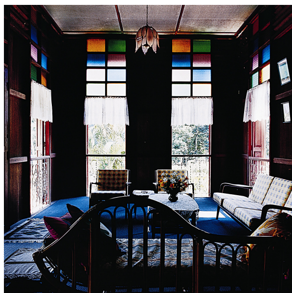
Simryn GILL from Dalam 2001 260 type C photographs, Courtesy the artist and Greenspace, Sydney.

Discuss and write about the differences you can see between the ways Gill has photographed Dalam and Inland . What does each series tell you about the social and cultural identity of the groups of people photographed – as seen through the evidence of the way they live?