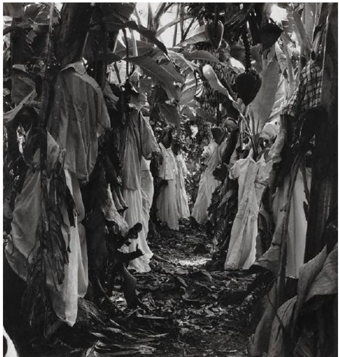
Simryn GILL from the series Rampant 1995 7 gelatin silver photographs 28.0 x 26.0cm Courtesy the artist and Greenspace, Sydney

In Rampant Gill photographed outbursts of introduced plant species in the Australian landscape such as bamboo and sugar cane, which now grow wild and uncontrolled in sub-tropical northern New South Wales. Again Gill incorporates performative elements, interacting with nature through 'dressing' the plants in garments such as lungis and sarongs which were worn by immigrant workers who harvested these crops. Gill explores the connections between botany, geography and the idea of plants as 'humanised' entities – seen in these strange single or groups of 'figures' appearing displaced within the Australian landscape.