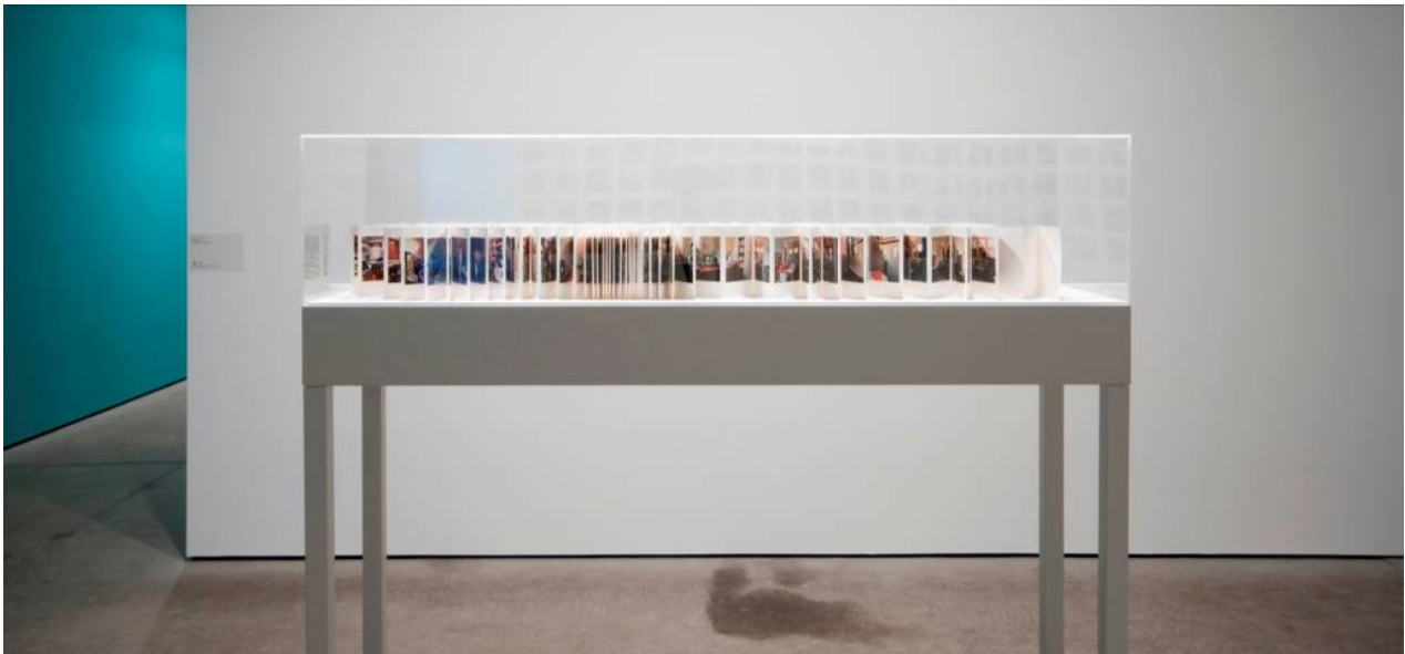
Simryn GILL Distance 2003 artist's book. Installation view, Centre for Contemporary Photography, Melbourne

In this series Gill tears up pages from books, imitating plant parts and inserting the still readable but torn pages into local natural environments. The leaves of books thus imitate aspects of nature. These fragile installations in the environment are subject of her large black and white photographs, the series Forest . In this instance, photographs record Gill's interventions in the landscape, bringing an ephemeral site-specific installation into the gallery.