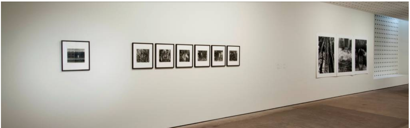
Installation view, Centre for Contemporary Photography, Melbourne