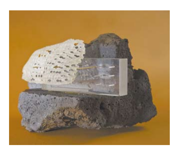
Volcanic rock specimens and concept model 2009 Volcanic rock, acrylic, polymer 3D print, threaded brass rods, lacquer Concept model – approx. 11 x 17 x 10cm

For a detailed discussion about the transformation of the earth's surface and rapid changes to the landscape of the Western District since European settlement refer to E.B Joyce's chapter in Designing Place , ('Geology, Environment and people on the Western Plains of Victoria'), and Heather Builth's chapter ('The cultural and environmental landscape of the Mount Eccles lava flow')