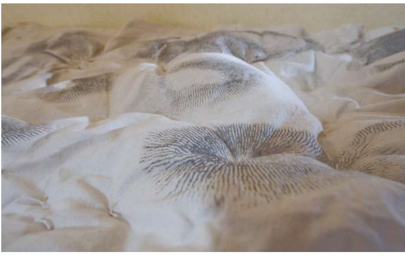
Dormant 2009 – 2010 Found studio objects (timber), carbon release prints on canvas 197 (h) x 200 (w) x 250 (d) cm