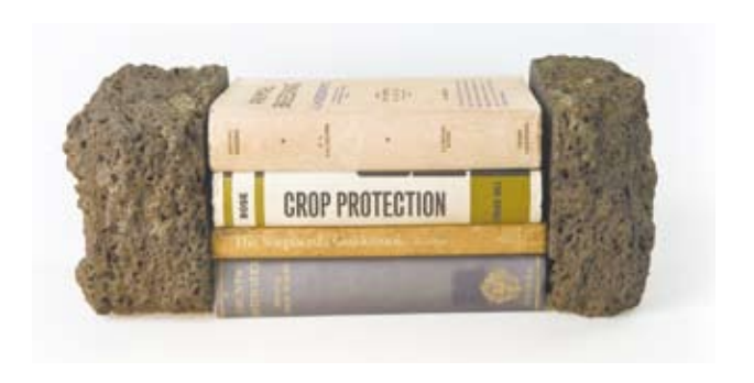
Top: A Country Reader 4 2009 Stone from the Tyrendarra lava flow, southwestern Victoria, rope