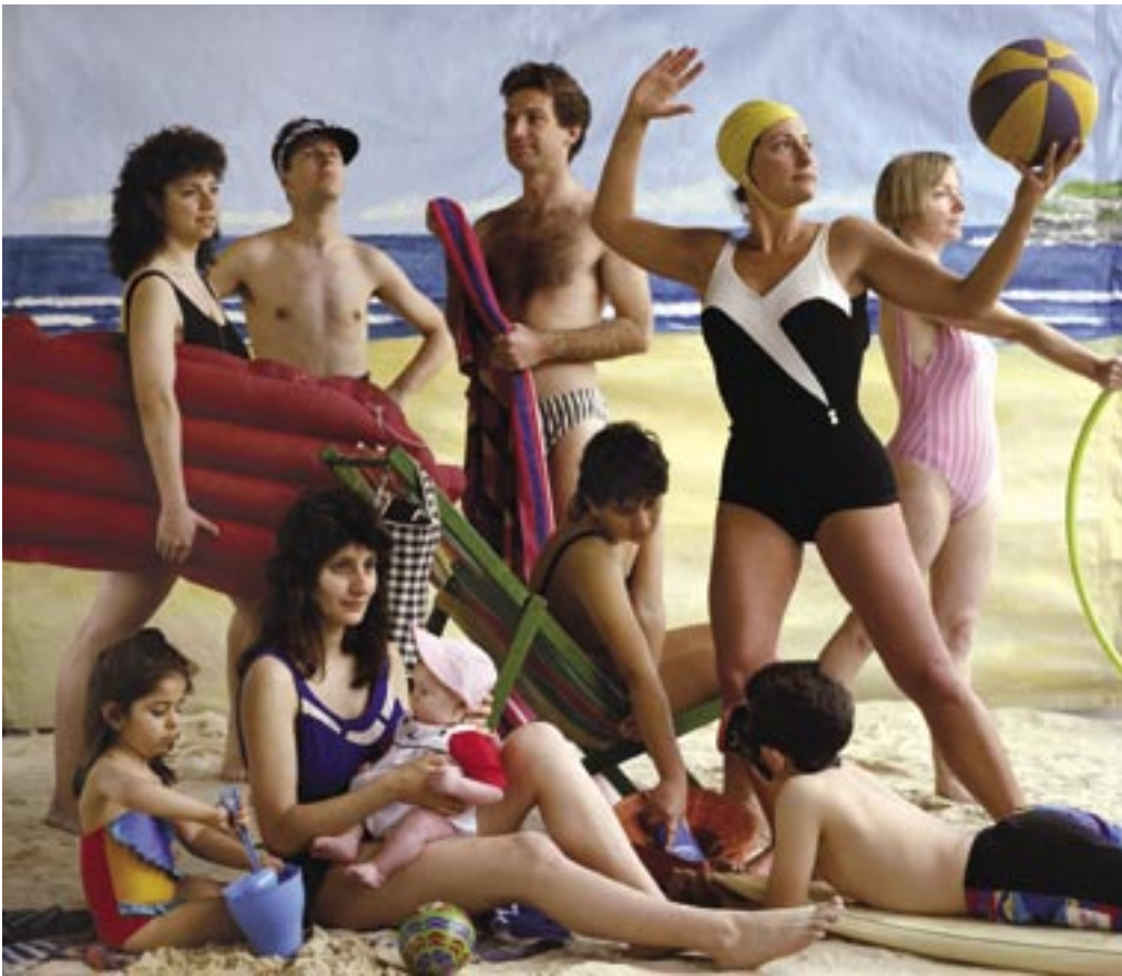
The Bathers 1989 type C photograph 74.0 x 90.0 cm