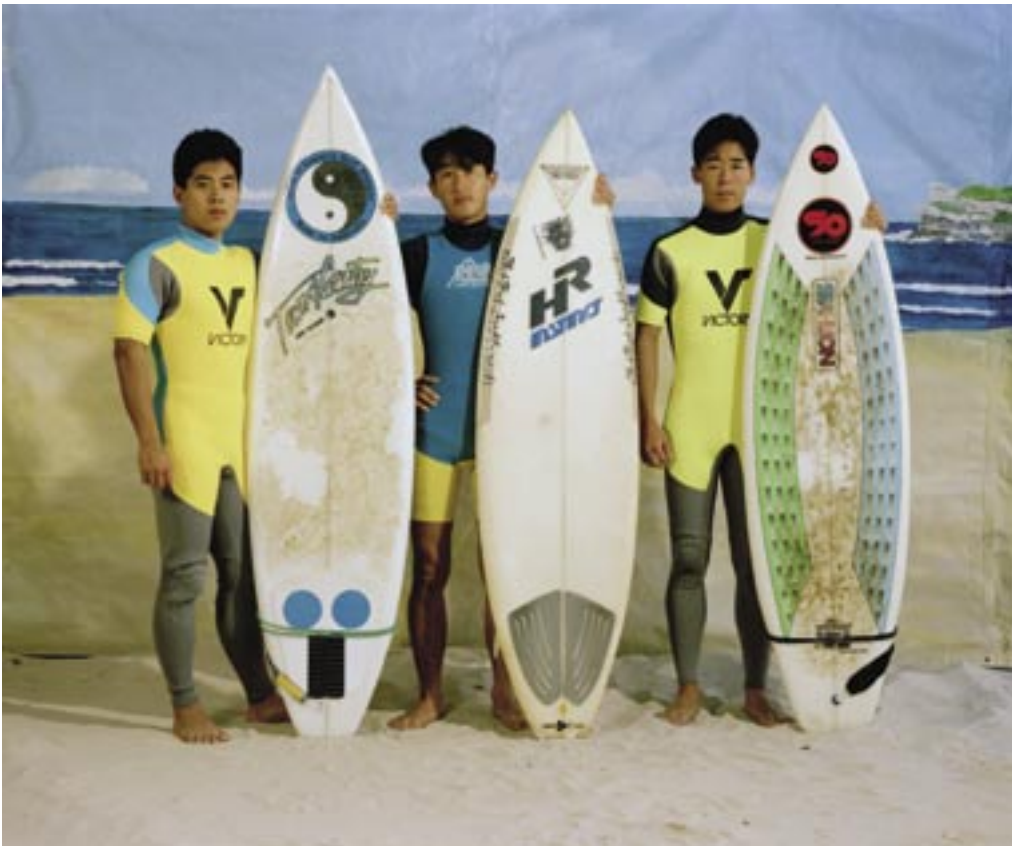
The Surfers 1989 type C photograph 74.0 x 90.0 cm