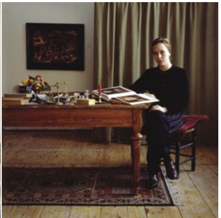
The Artist (self portrait), Berlin 1987 cibachrome photograph 80.0 x 80.0 cm