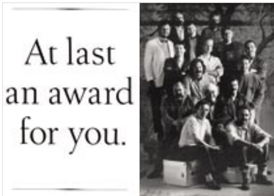
(above) Advert for the inaugural FUJI Professional Photography Awards 1989

At last an award for you 1989 type C photograph 48.0 x 40.0 cm