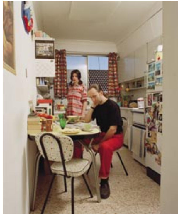
Saturday, 2:48 pm 1995, duratran and light box 125.0 x 176.0 x 25.0 cm Monash University Museum of Art, Melbourne