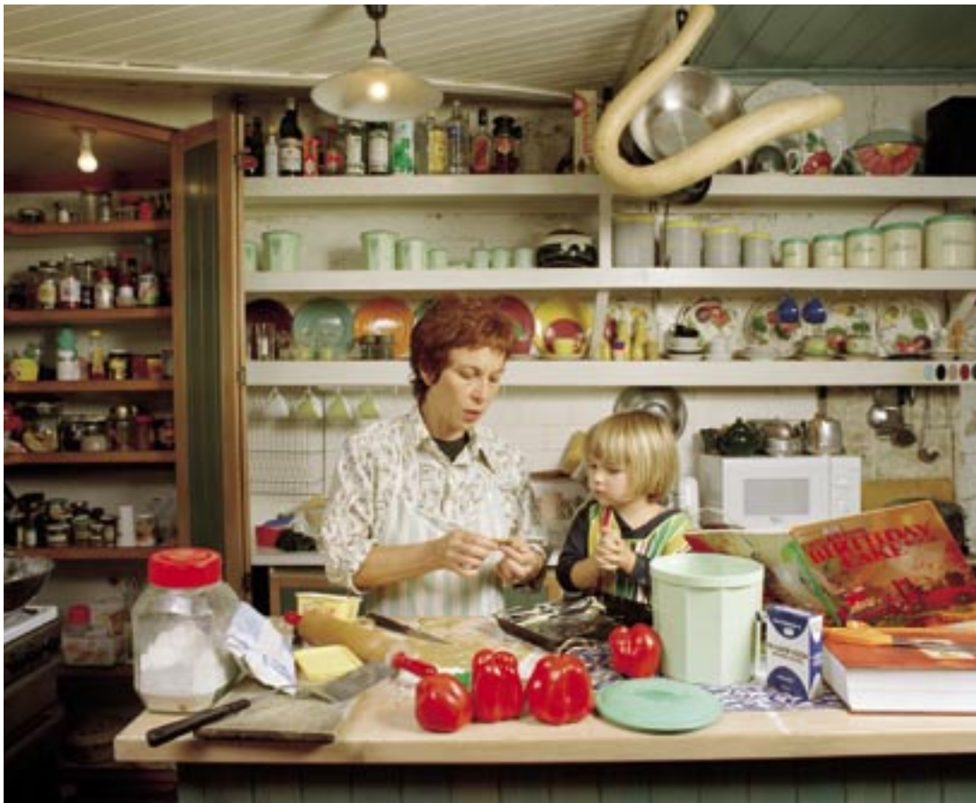
The Cooking Lesson 2000 type C photograph 50.0 x 60.5 cm

In art history there is a tradition of artists creating self-portraits. Not only is this a way of creating a lasting image of oneself, self-portraiture can also serve to announce one's vocation and skill as an artist, one's place in society or one's style, it also guarantees a readily available subject. Often artists will depict themselves in the studio or surrounded by their materials and include references to the ideas and subjects that inspire them.