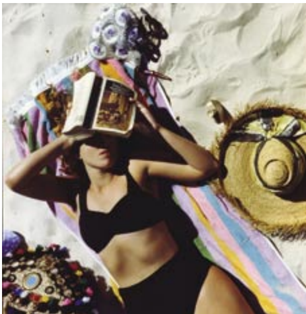
The Sunbather #1 1989 type C photograph 49.0 x 49.0 cm