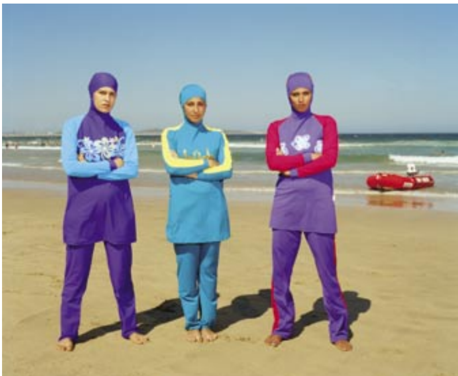
The Girls #2, Cronulla Beach 2007 type C photograph 74.0 x 90.0 cm