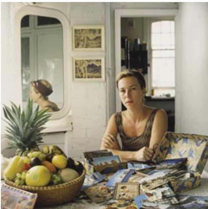
The Collector (self portrait) 1988 cibachrome photograph 50.0 x 50.0 cm