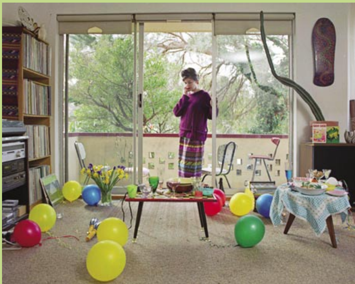
Sunday, 2:09 pm 1995