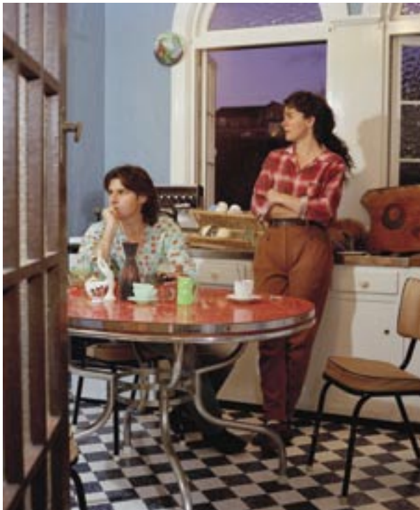
Saturday, 5:18 pm 1995 type C photograph 81.0 x 66.0 cm

"In all their variety, the images are united by Zahalka's interest in the ability of the camera to simultaneously display and deceive, achieved through the use of theatrical settings, props and poses." 7