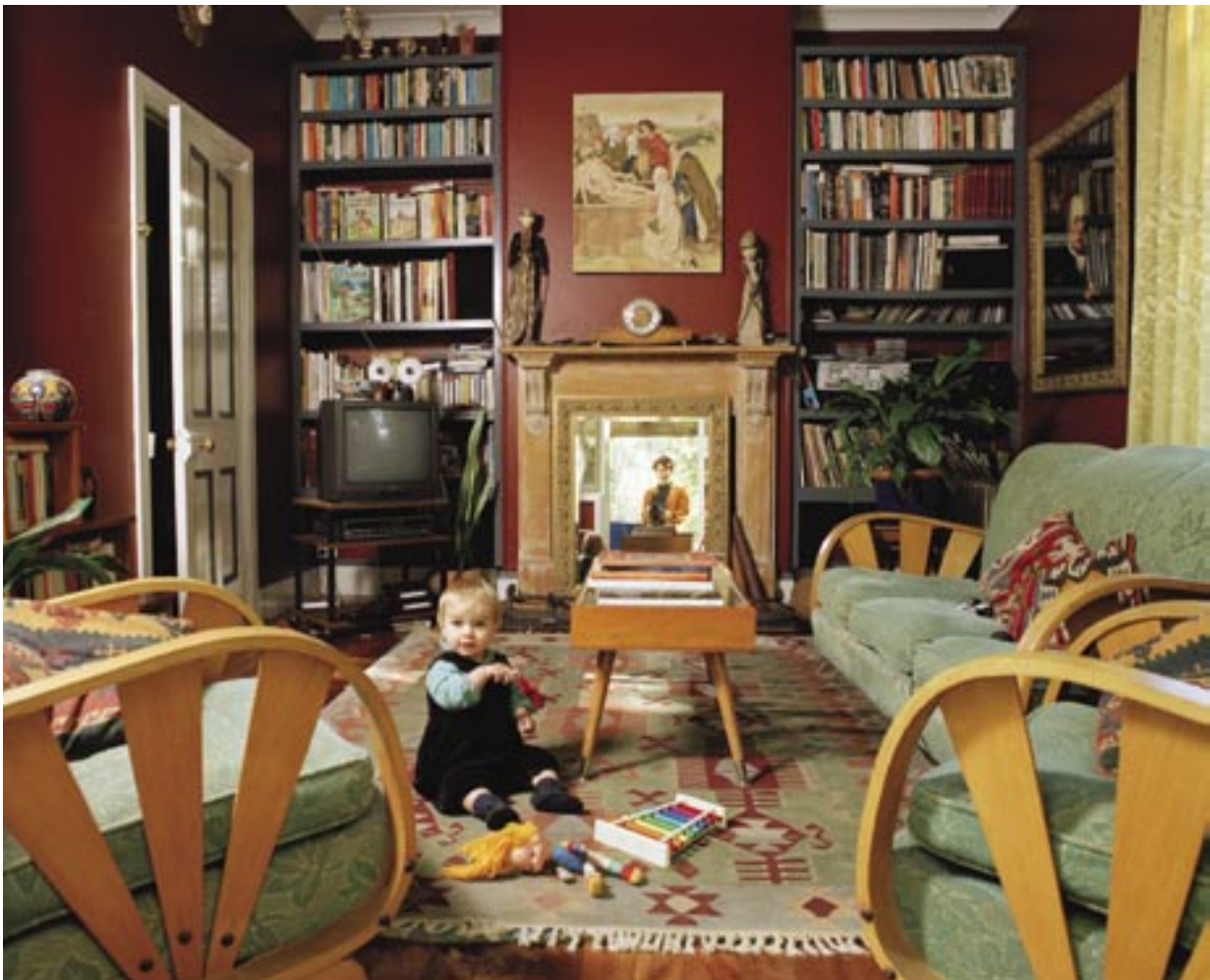
Home 3, Anne and Alice Zahalka (version 2, from the series How Jewish is your Home?) 1998 type C photograph 50.0 x 60.5 cm