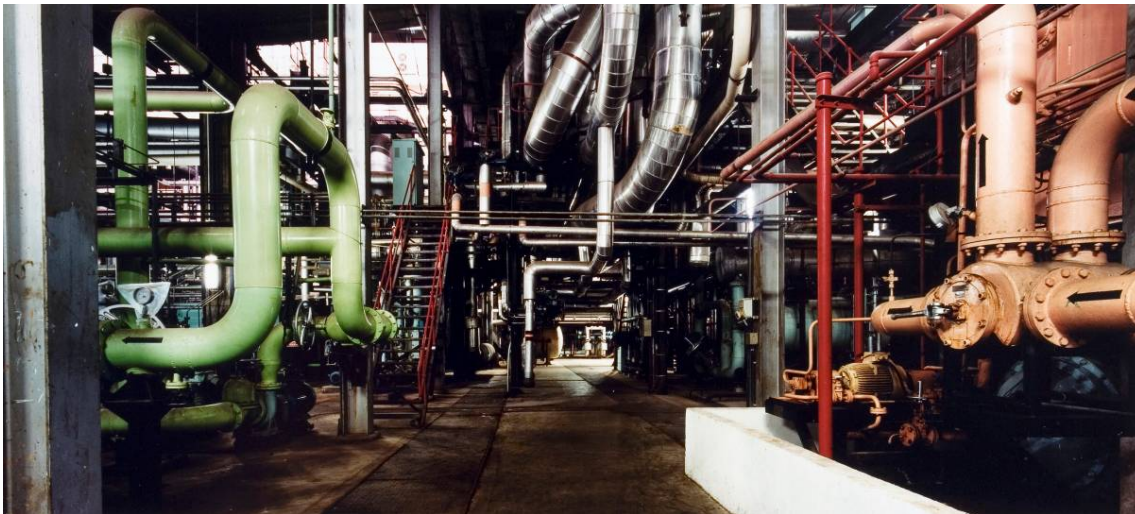
Simryn GILL from Power station 2004 , 13 type C photographs and 13 silver gelatine photographs

In Powerstation (2004) , a series of comparative photographs, Gill has recorded the interiors of two buildings – her family home in Port Dickson, Malaysia and the adjacent power station. The series comprises thirteen pairs of images in panoramic-format; the industrial interior in colour photography on one wall mirrored by the domestic interior in black and white on the other. Built in the 1960s, the power station was decommissioned at the time the series was taken and is currently being converted from oil to a less polluting gas-fuelled powered plant using Japanese technology. Again, what is noticeable is the absence of people, though evidence of their habitation is provided through the documentation of work places and objects within the living space.