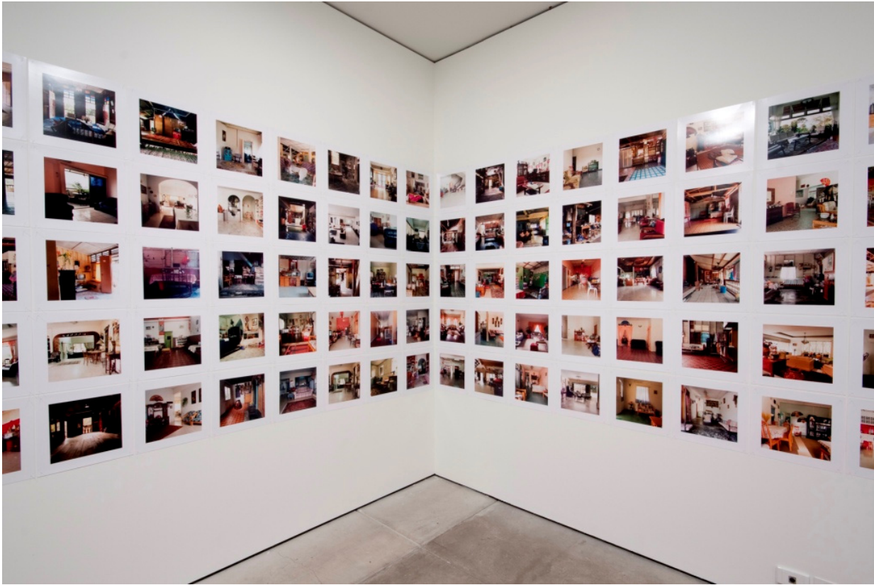
Simryn Gill Dalam 2001 , 260 type C photographs, Installation view, Centre for Contemporary Photography, Melbourne

Simryn Gill: Inland is curated by Naomi Cass, the Director at the Centre for Contemporary Photography (CCP) – one of Australia’s premier venues for the exhibition of contemporary photo-based arts, providing a context for the enjoyment, education, understanding and appraisal of contemporary practice. This exhibition is the second biennial survey at CCP, following Hall of Mirrors: Anne Zahalka Portraits 1987-2007 .