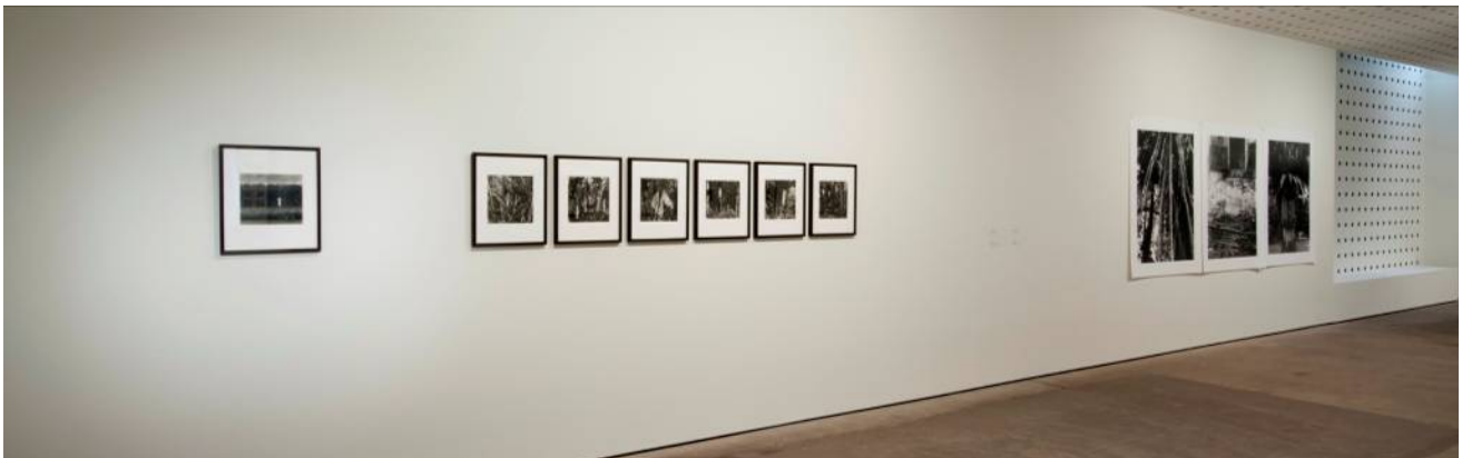
Installation view, Centre for Contemporary Photography, Melbourne