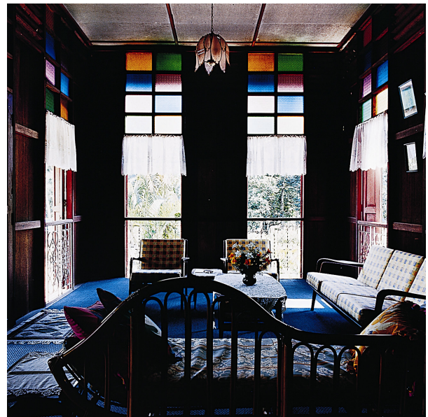
Simryn GILL from Dalam 2001 260 type C photographs, Courtesy the artist and Breenspace, Sydney.

Discuss and write about the differences you can see between the ways Gill has photographed Dalam and Inland . What does each series tell you about the social and cultural identity of the groups of people photographed – as seen through the evidence of the way they live?