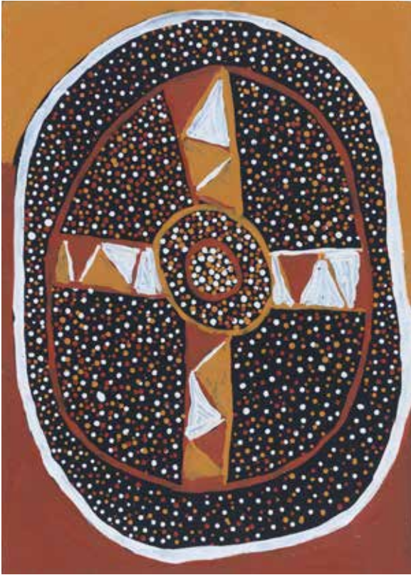
Timothy Cook Kulama 2013 natural pigments on paper 106 x 76 cm (sheet) © Courtesy the artist and Jilamara Arts & Crafts Association, Melville Island, NT and Seva Frangos Art, Perth

Timothy Cook (Tiwi, Melville Island, born 1958)