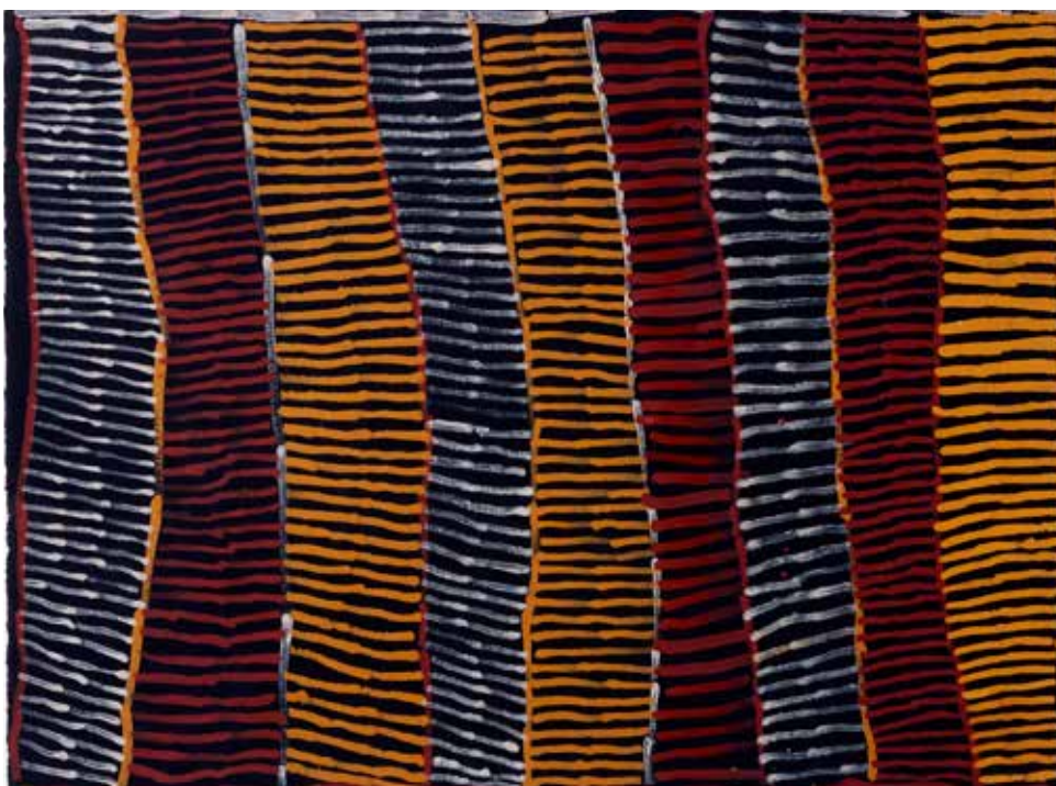
Freda Warlapinni Pwoja 2001 natural pigments with acrylic binder on paper 56 x 76 cm

Personal Framework – Art and Studio Unit 2