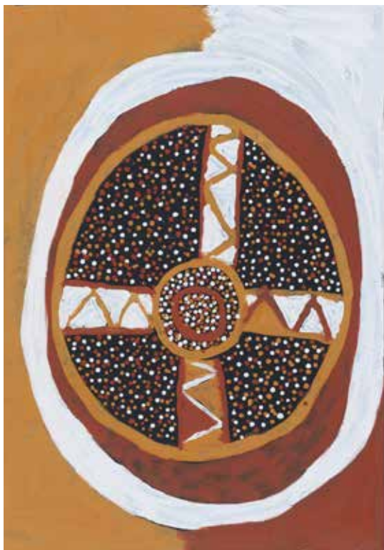
Timothy Cook Kulama 2013 natural pigments on paper 106 x 76 cm (sheet) Courtesy the artist and Jilamara Arts & Crafts Association, Melville Island, NT and Seva Frangos Art, Perth

Cook's work is widely celebrated for drawing a classical style of Tiwi painting into dialogue with his own individual take on Tiwi tradition and history. His paintings picture a hybrid space in which iconographic representations of Tiwi ceremony—in particular the once-annual ceremony known as the Kulama—are often positioned in relation to the Catholic cruciform. Emblematic of the influence of the missions that held sway on the islands for much of the twentieth century, Cook's explicit appropriation of such a charged colonial signifier (effectively subsumed within his paintings by Tiwi systems of belief) presents evidence of a unique intercultural heritage.