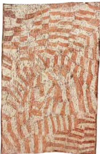
Nyapanyapa Yunupingu Pink and white 2011 natural pigments on bark 82 x 54 cm Private collection, Melbourne

It's a perfect example of the kind of relationship the exhibition sets up when you see her work in comparison to Marawili's. His work defines the opposite pole of current Yolngu art; a space where, from a Yolngu perspective, every mark is laden with textual meaning, quite literally 'readable' in terms of ancestral and clan connections. From this perspective, Yunupingu's work is seen as very minor indeed. I mean, in a context where individual status is contingent on the articulation of collective bonds and responsibilities, why would someone choose to paint nothing? It's the western context that creates the space for this to happen and be celebrated. Beyond format and material, Marawili's major painting Buru , (2007), which depicts the ancestral events associated with the birth of fire, actually has a greater resonance with Ngarra's or Rusty Peters' work. These artists also paint epic narrative—ancestral stories and their relation to the land.