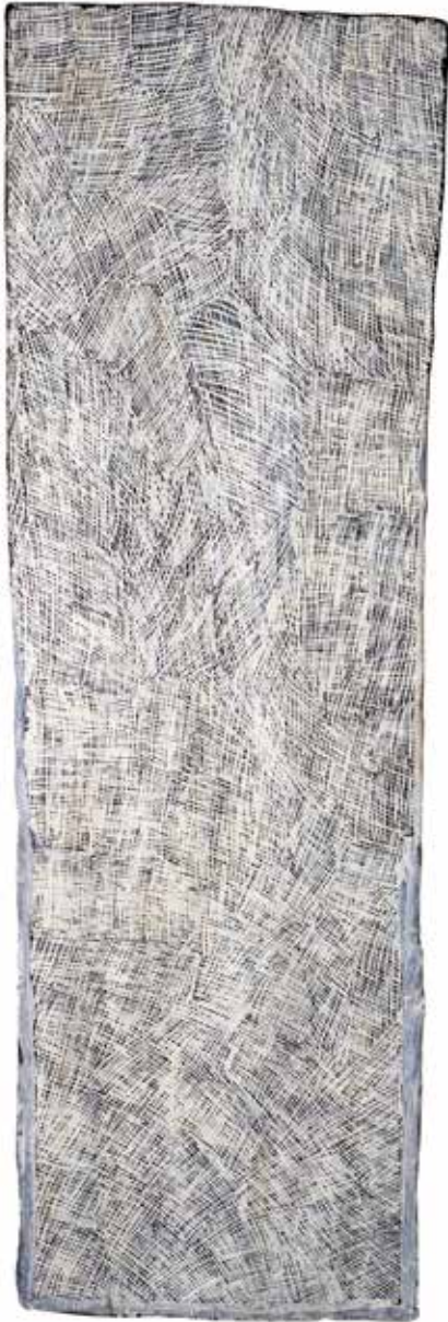
Nyapanyapa Yunupingu Untitled 2012 natural pigments on bark 158 x 51 cm Private collection, Melbourne

Nyapanyapa Yunupingu's recent practice takes a strikingly divergent approach to that of many of her Yolngu contemporaries. Initially recognised as unique for drawing personal narratives and memories into her bark paintings and prints—a sphere usually reserved for ancestral narratives and clan related iconography—her approach has since taken a step towards what we might categorise as outright abstraction.