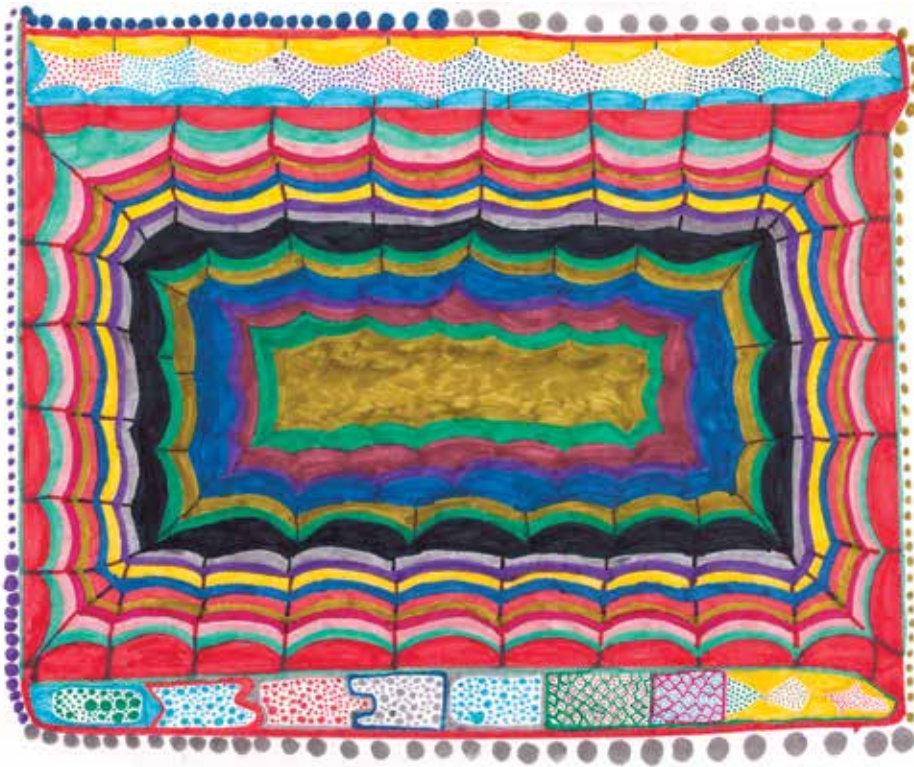
Ngarra Untitled 1998 fibre-tipped pens on paper 29.7 x 42 cm Collection of Ngarra Estate, courtesy Mossenson Galleries, Perth