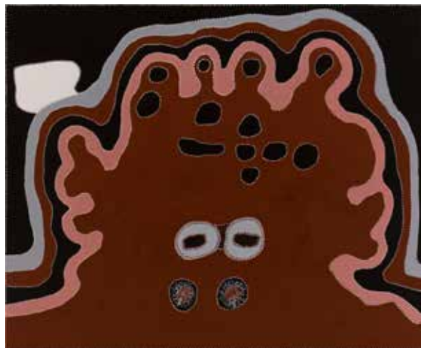
Rusty Peters Smoke Dreaming 2008 natural pigments and acrylic binder on canvas 150 x 180 cm Works courtesy the artist and Warmun Art Centre, WA; and Short Street Gallery, Broome, WA

...Ngarra's drawings form another key aspect of the exhibition. They were made over a decade ago and have never been shown before, simply because they are so unusual within the canon of Aboriginal art.